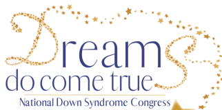
Exhibit at the College Fair National Down Syndrome Congress Convention Orlando, FL Friday, July 21, 2023 12 pm - 5 pm

The College Fair is an opportunity to showcase all of Florida's FPCTPs.